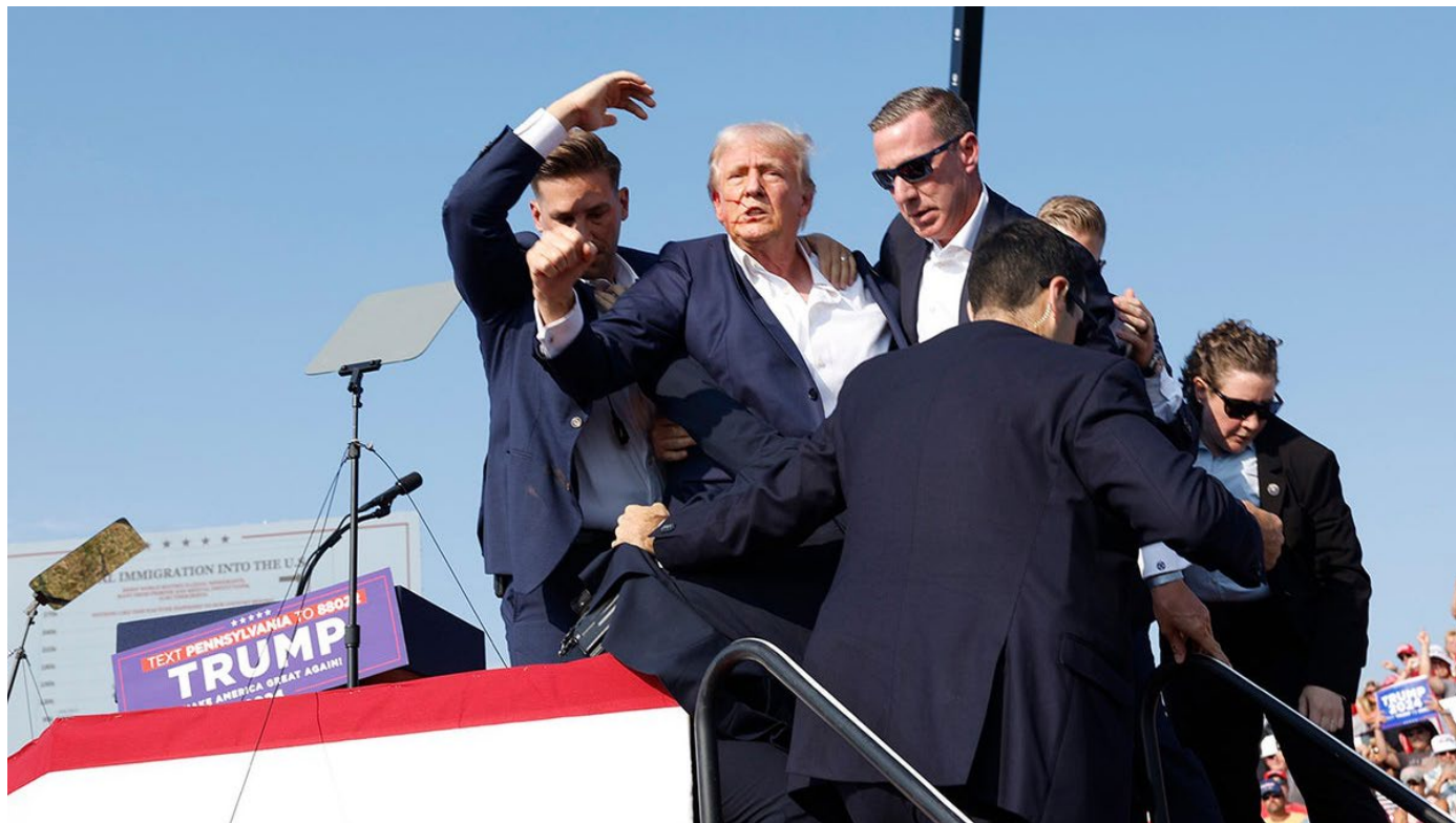
Republican presidential candidate former President Donald Trump is rushed offstage during a rally on July 13, 2024, in Butler, Pennsylvania.

Americans know that Kamala Harris is not up to the job of being president of the United States which is why her approval rating is as low as 35%. They are against Harris's desire to remove the Senate filibuster and pack the Supreme Court so that Democrats can impose their unpopular agenda. They are concerned that she did not earn her nomination but was anointed by party bosses and donors, reminding voters of her long history of coddling the powerful while paying lip service to the people.